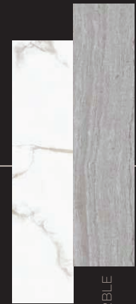
CALACATTA LUXOR MARBLE