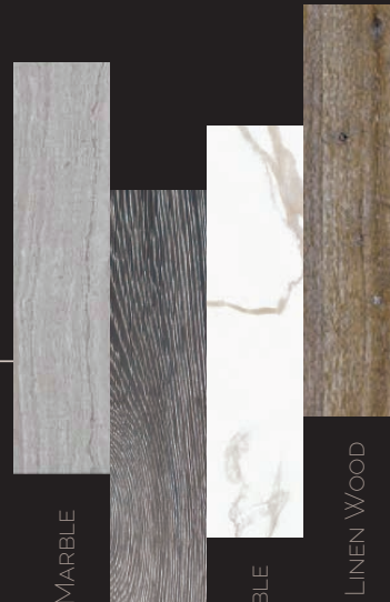
GREYWOOD VEIN CUT MARBLE