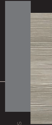
DARK GREY GLASS