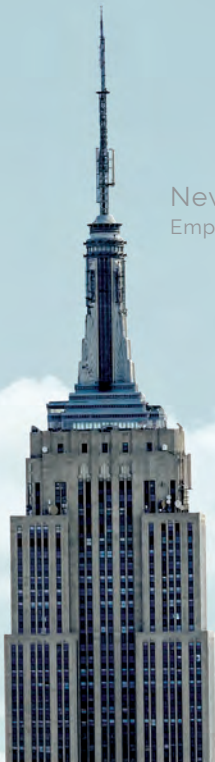
New York Empire State Building