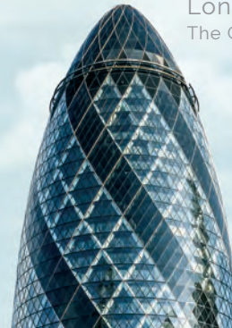
London The Gherkin