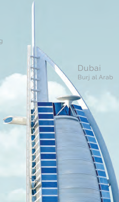
Dubai Burj al Arab