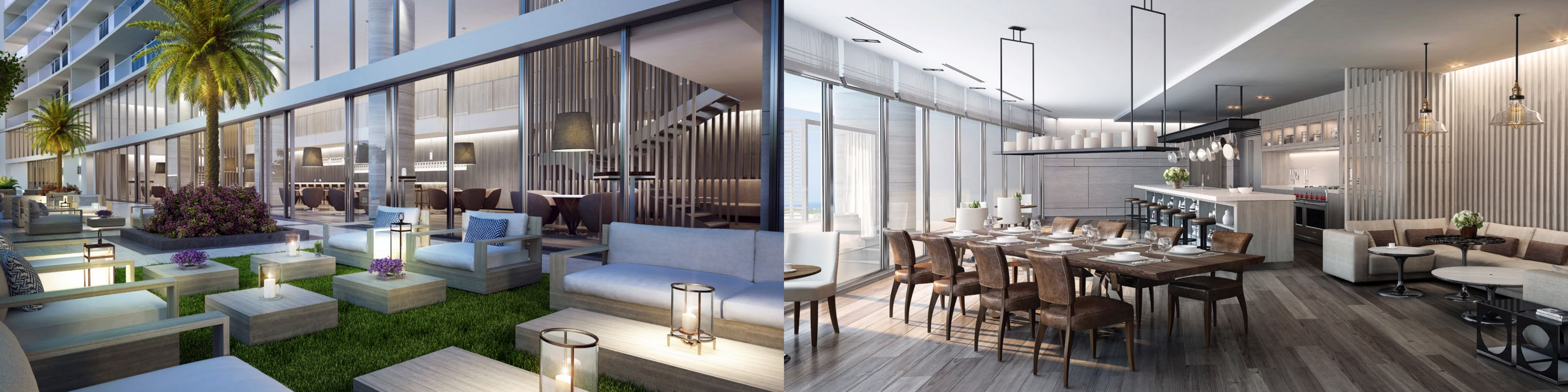
The River Club extends through both the 4th and 5th floors with the two-story owners' lounge and wine cellar, complemented by the one-of-a-kind Cucina – a dinner party kitchen for you and 20 friends.

"They've created a waterfront lifestyle you cannot duplicate."