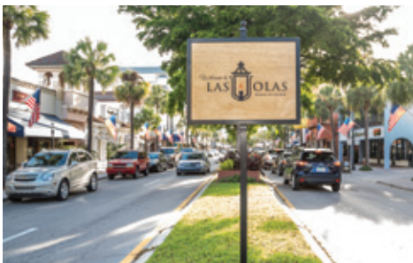
19 Las Olas Blvd.