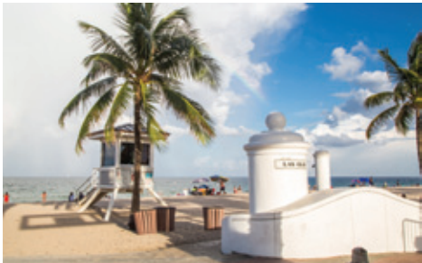
18. Ft. Lauderdale Beach